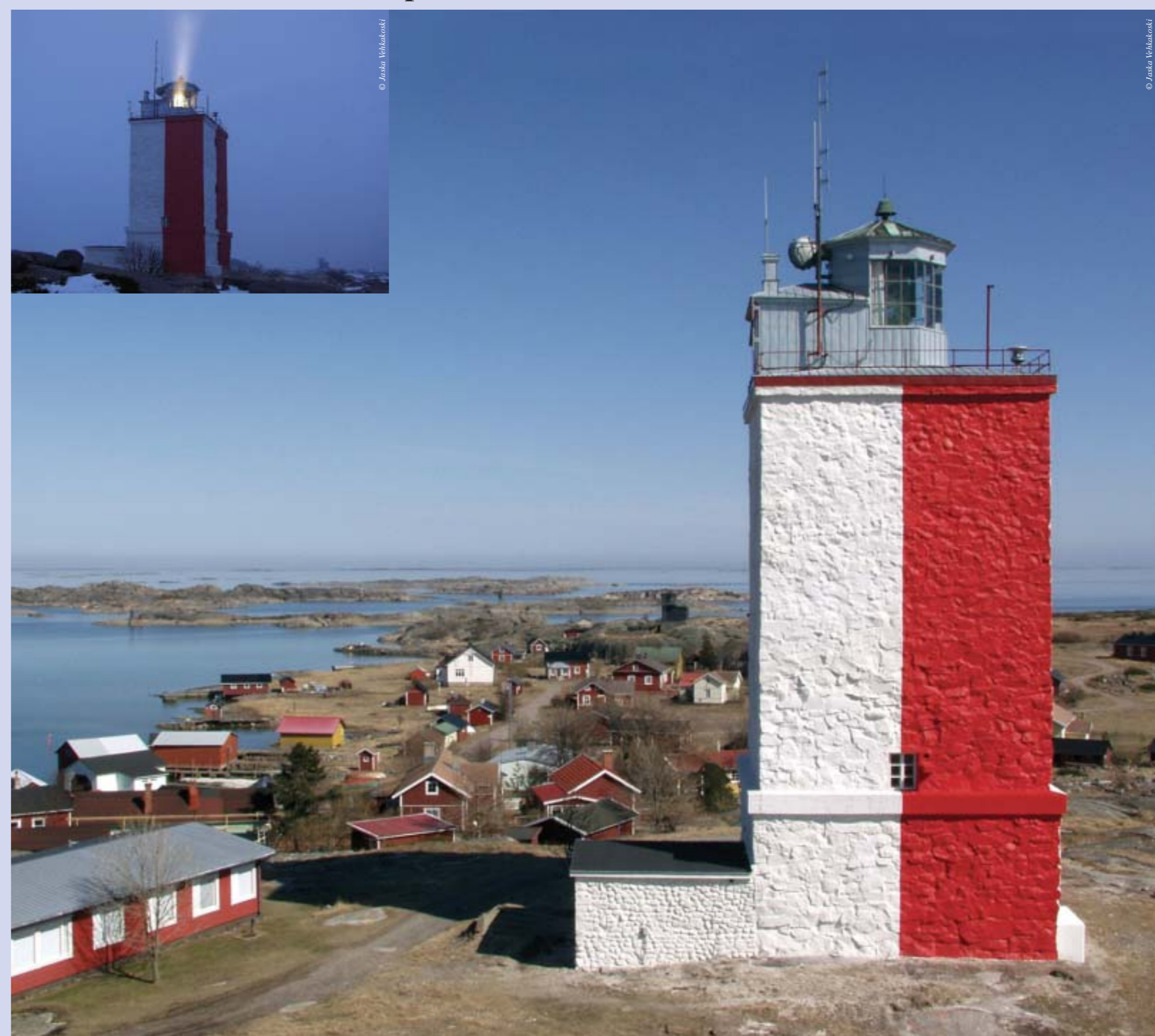
Utö lighthouse is the oldest lighthouse in Finland and located in the archipelago village Utö.

Lighthouse tourism project promotes tourism on lighthouses in southwest Finland and in Estonia. The project is coordinated by the Centre for Extension Studies of the University of Turku. The project takes place 1.4.-31.12.2007 and is a part of Interreg IIIA programme financed by the EU, Ministries of Interior in Finland and in Estonia, several towns and municipalities, enterprises and organisations and associations related to lighthouses.